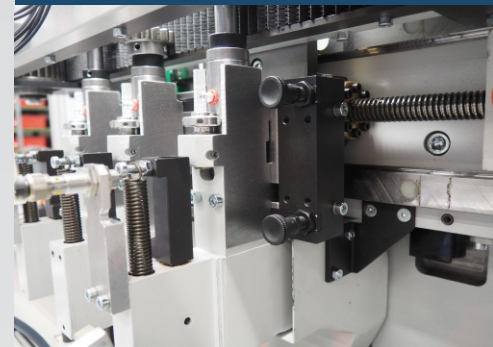
Drill head with mounting gauge